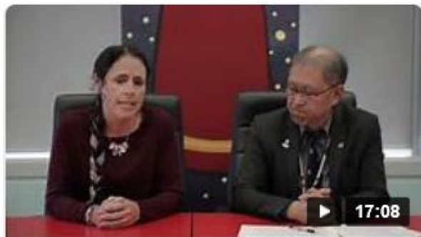
COVID-19: Indigenous Services Canada Update

9.3K views · 6 days ago YouTube › GCIndigenous