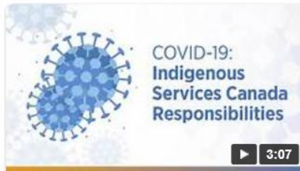
COVID-19: Indigenous Services Canada Responsibilities

9.3K views · 6 days ago YouTube › GCIndigenous